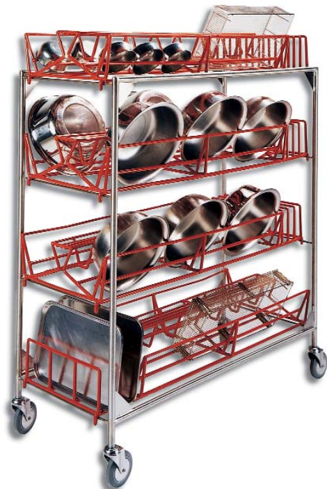
UC 6000 Multi-Level Utensil Wash Cart