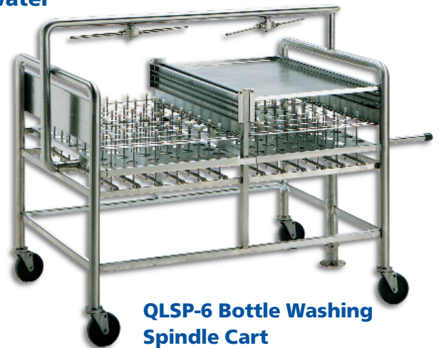
QLSP-6 Bottle Washing Spindle Cart

For additional product information please contact the factory or the Scientek representative in your area.