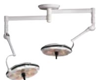
Surgical and Exam Lights