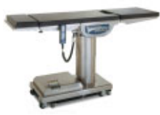
C-Section Tables with up to 1,000 lb. Capacities