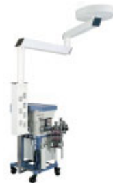
Anesthesia Tether Skyboom