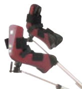
Full Line Table Accessories