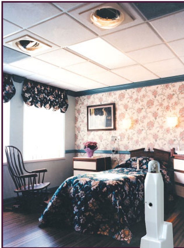
Charging Base with Strobe-Guided Remote Control