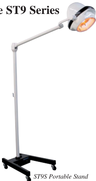
ST9S Portable Stand

Skytron's Advanced ST9 Series Exam Light incorporates many of the features of our leading Stellar Major Surgical Lights, including State-Of-The-Art higher intensity, non-glare optics. Lighthead construction consists of a new, radically durable and featherlight polymer material for optimum performance, maneuverability and durability.