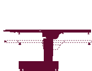
39" Max. 29" Min. Table Height

180° Top Rotation provides Full Body Imaging & Uninterrupted C-Arm approach as well as clearing the base for seated Surgeons.