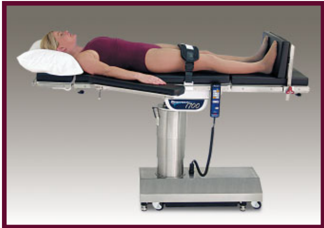
Upper Body Imaging