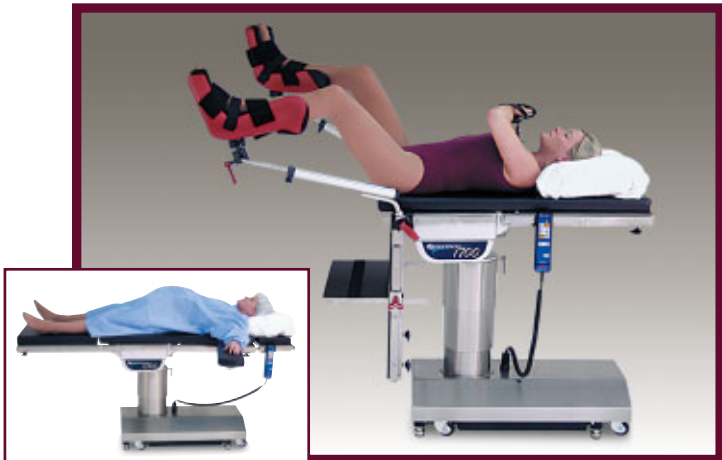
OB/GYN & C-Section